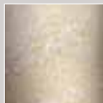
Ivory Opalescent (IVO)